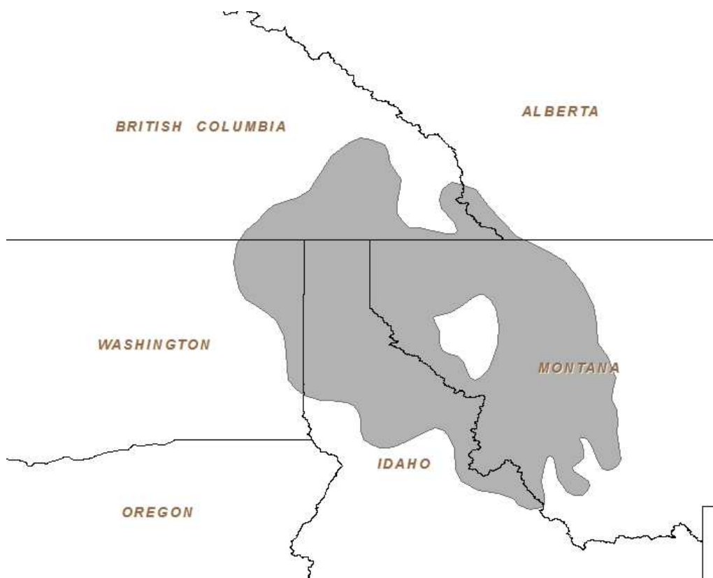
Figure 1. General range of Tamias ruficaudus . T. r. ruficaudus occupies the eastern half of the range, and T. r. simulans occupies the western half including WA with small zones of overlap in ID and MT.